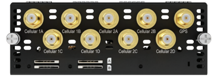
2x 5G Modules