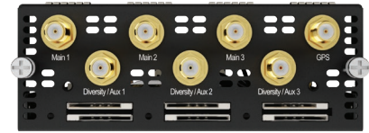
3x LTE-A Module (EXM-3LTEA)