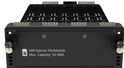
SIM Injector FlexModule (EXM-SIM-BK56)