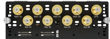
2x LTE-A Pro Module (CAT-18)